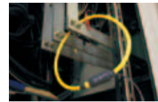
For large-diameter applications such as busbars

Measurable conductor diameter \phi 254 mm (10.00") Cable diameter \phi 13 mm (0.51")