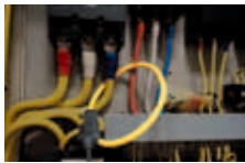
In confined spaces

Measurable conductor diameter \phi 100 mm (3.94") Cable diameter \phi 7.5 mm (0.30")