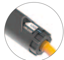
Connection lock mechanism