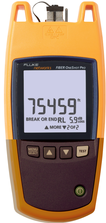
Fiber OneShot PRO

Most troubleshooting solutions for today's fiber network are inefficient and take too much time. Simple tools like lasers (VFLs) are easy to operate but extremely repetitive and tiresome; most VFLs have distance limitations of 2 or 3 miles (3,218 or 4,828 metres). At the high end, Optical Time Domain Reflectors (OTDRs) can work as troubleshooters but their advanced analysis and trace capabilities are better suited for certifying and documenting cable installation quality. What field technicians really need is a first-line diagnostic tool that locates fiber cabling problems accurately, the first time. Fiber OneShot PRO's simple, one-button test feature, its speed and its distance capability make it your perfect frontline fiber troubleshooter.