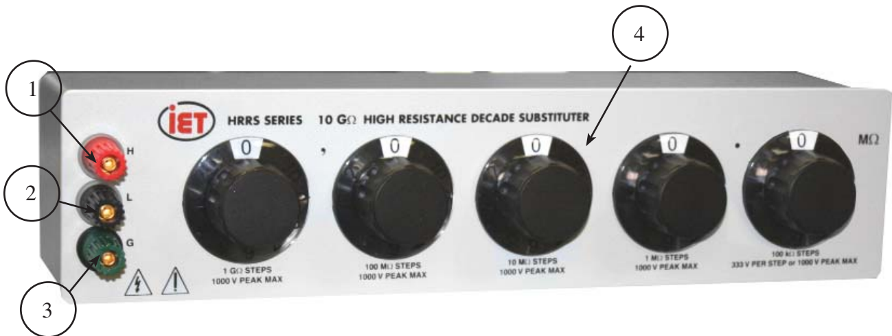
Figure 4-2: Replaceable Parts