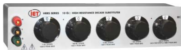
Figure 1-1: HRRS Series High Resistance Decade Substituter

The HRRS series complements the HARS series which provides resistance steps as low as 1 \text{ m}\Omega . The units may be rack-mounted to serve as components in measurement and control systems.