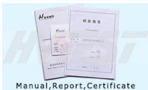
Manual, Report, Certificate