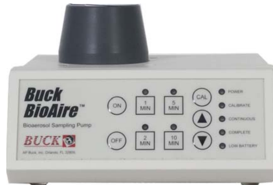
Controlled Flow Sampling Pump for Bioaerosols

*Depends on battery maintenance, backpressure, etc.