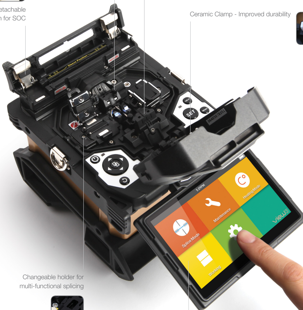
Changeable holder for multi-functional splicing