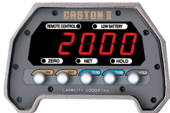
▲ Display & Key board