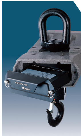
► Battery Pack Installation