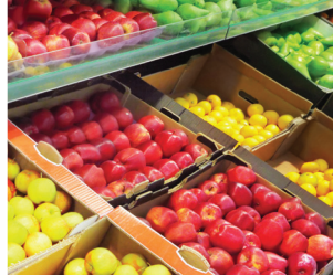
Ticket & Label Printing