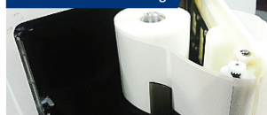
High resolution and speed printer